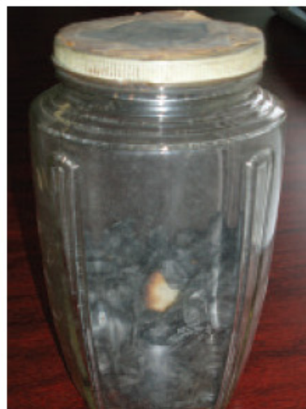
In the 1930s the congregation held an anniversary party to launch a fundraising drive to pay off the mortgage on the synagogue. In March of 1945, they held a party to celebrate their success, and happily burnt the mortgage, whose remnants are kept in this jar.