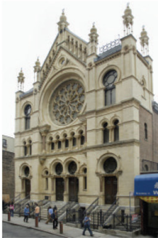
The Eldridge Street Synagogue opened in 1887; by 1900 many of its founding members had moved uptown.

meant moving up, going from an immigrant slum to a middle class section of the city, not just from a cold-water tenement to a modern apartment with indoor plumbing.